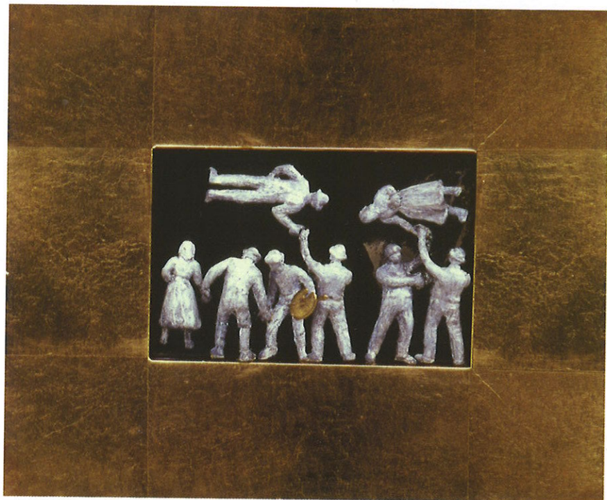
Вистави в маленьких скриньках. Серія. Дерево, позолота, папір, гуаш, мішана техніка. 2001-2002. Big 15x15 до 25x20.