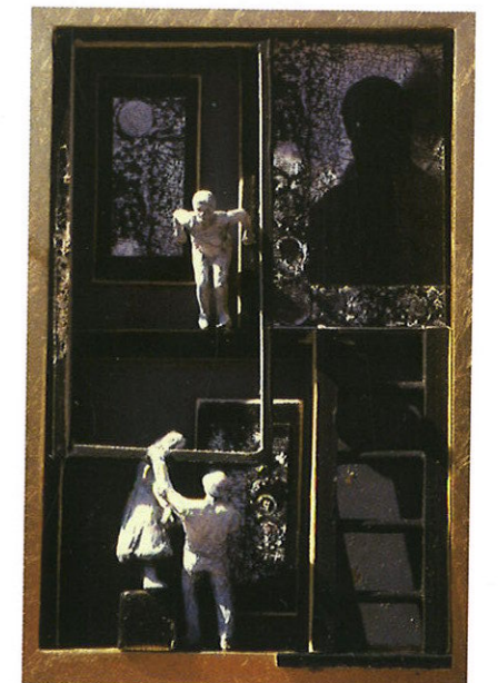
Miniature tableaux from the "Boxed" Series. Gold leaf, paper, mixed media. 2001-2002. From 15x15 cm to 25x20 cm.